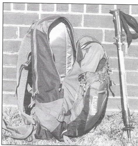
Figure 4—Camelback Fourteener backpack (with LowePro as insert).