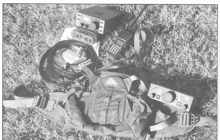
Figure 1—ICOM-703+ with ICOM backpack setup.