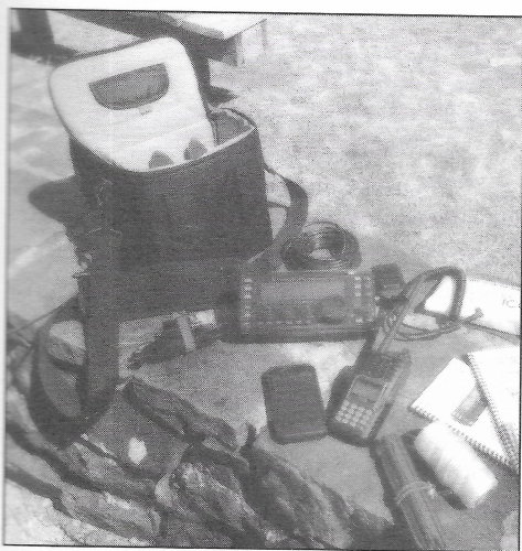
Figure 3—LowePro 170AW (All Weather) camera bag.