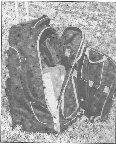
Figure 6—High Sierra suitcase with removable backpack.

As you would expect—tough trade-offs must be implemented vs. how much radio equipment, camping gear, personal items and food/water, etc. comprise such a configuration.