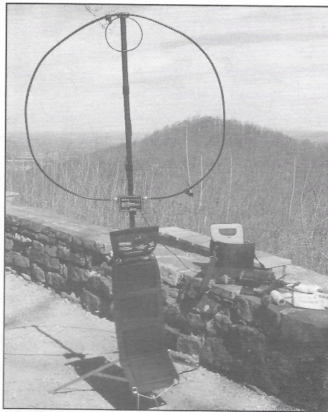
Figure 7—AlexLoop and backpack solar charging setup.

biggest obstacles to overcome with portable operations—where A/C electricity sources are not available—is that of recharging batteries. Ok, you can use a car's system to do this, but what can you do when no cars are available?